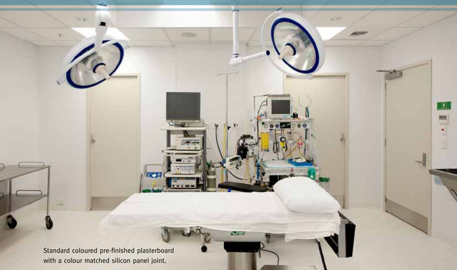
Standard coloured pre-finished plasterboard with a colour matched silicon panel joint.